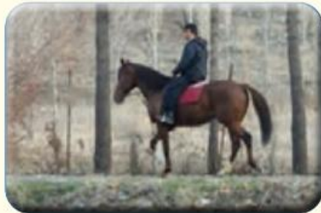
ride a horse