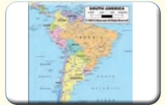
South America / South American