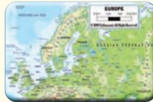
Europe / European