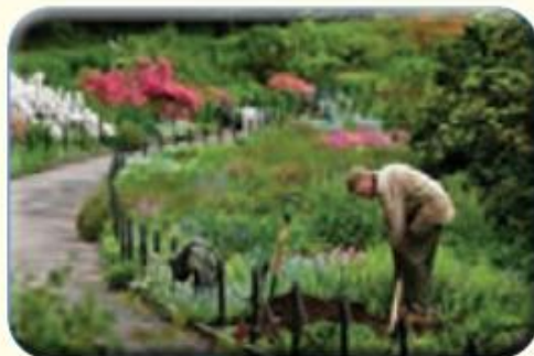
working in the garden