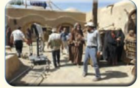
act in movies