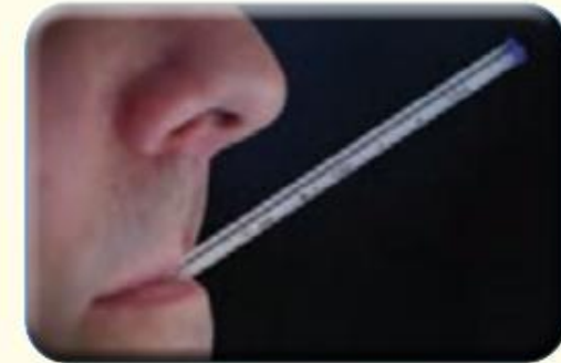
have a temperature/fever