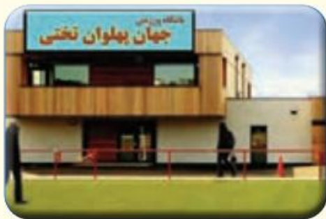
go to the gym