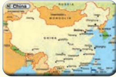
China / Chinese