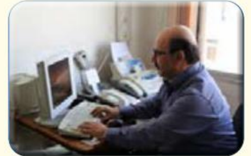
work with a computer