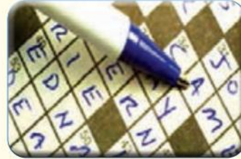
do a puzzle