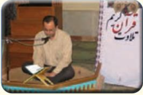
recite the Holy Quran