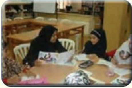
tell a story