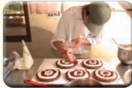
make a cake