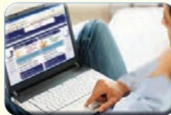
browsing the Internet