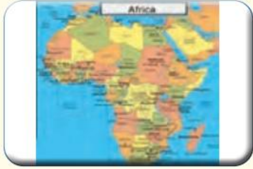
Africa / African