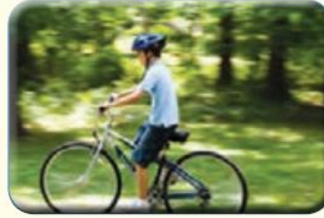
ride a bicycle