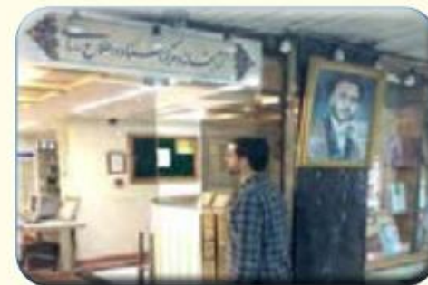
go to library