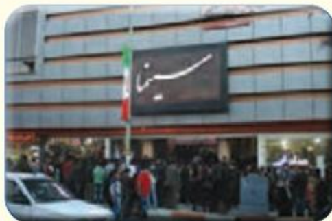
going to the movies