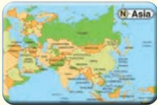
Asia / Asian