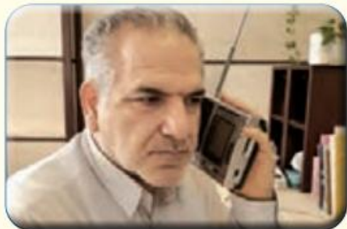
listening to the radio