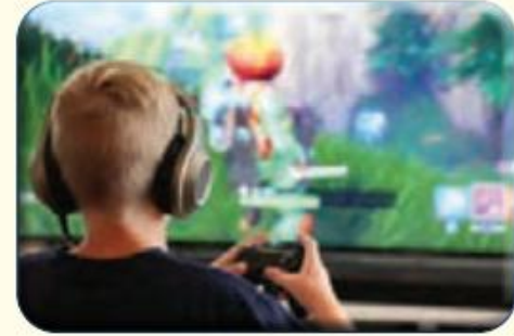
playing computer games