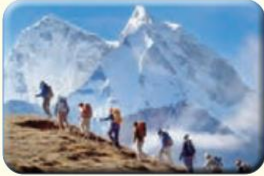
climb a mountain