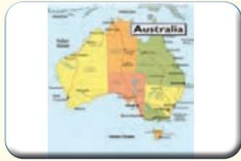
Australia / Australian