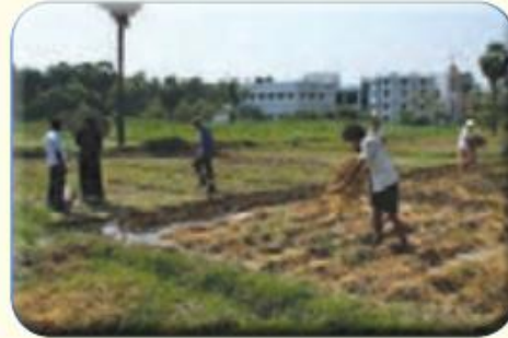
work on the farm