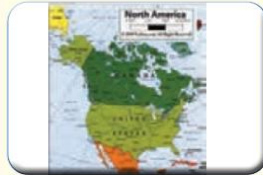
North America / North American