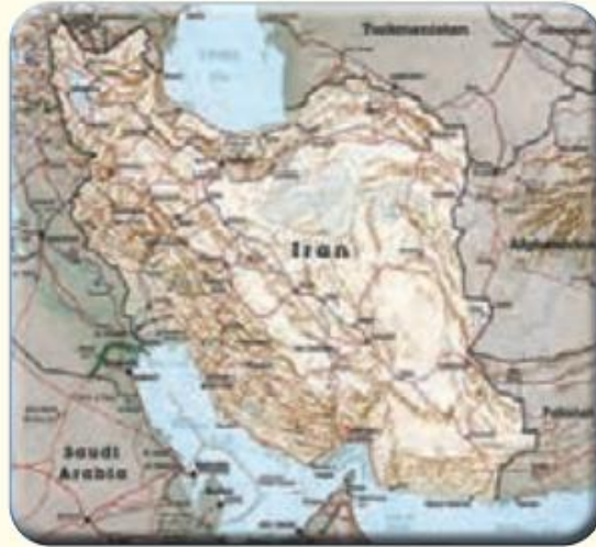
Iran / Iranian