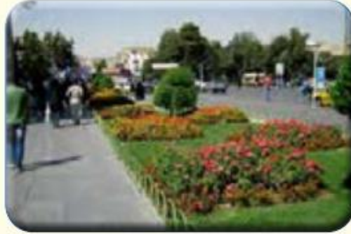
walking in the park