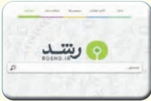
search the Web