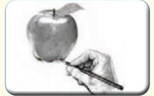
draw a picture